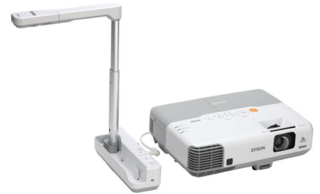
Share 3D objects using the ELP-DC06 document camera